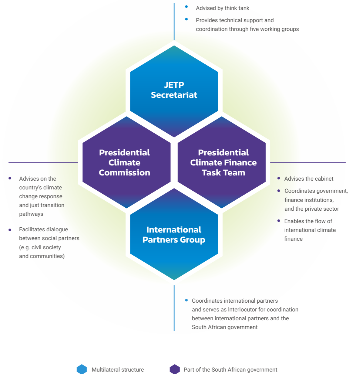
Figure 2: Governance structure in connection with the South African JETP

However, at this stage, there is no civil society representation in these groups and there is some concern about transparency. Just transition and environmental considerations will have to be incorporated into each working group.