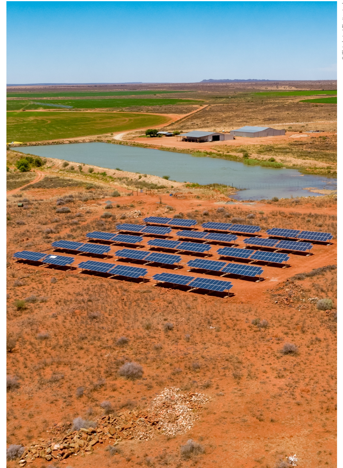
Solar Plants in Karoo, South Africa.

Actively demand participation – for example, international fellow CSOs should raise their voices to call for opportunities to participate