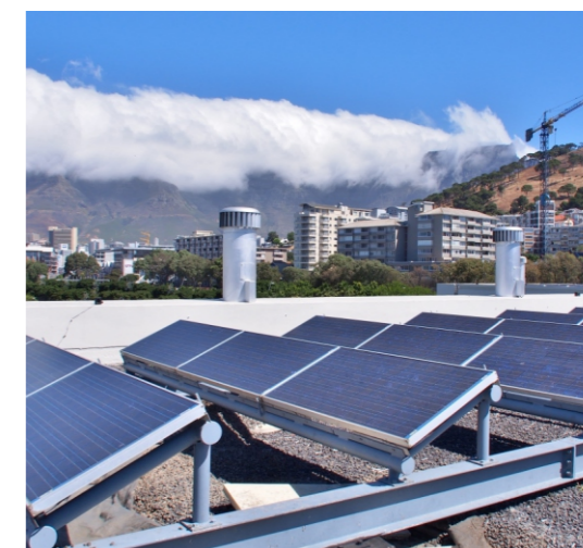
Solar panels on rooftop or terrace of building in Cape Town, South Africa.