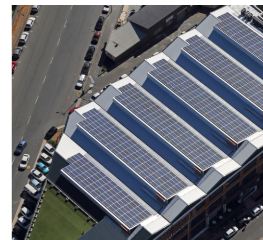
Aerial photo of solar panels on a rooftop, Cape Town, South Africa.

The PCFTT is also supposed to coordinate the mobilisation of funds, including the $8.5 billion pledged at COP26 (South African Presidential Office, 2022).